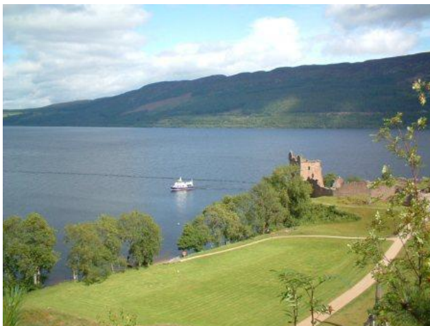
Loch Ness, Scotland